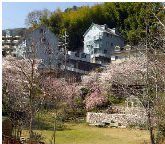
Japan Mission property and garden below

be used by the community. He even put in some swings, slides and other playground equipment for the children.