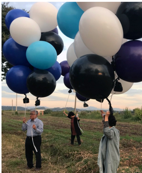
Launching balloons into North Korean

1. Manna Project – Balloons are regularly launched into North Korea at night, carrying food, medical supplies, and CDs, USBs, flash drives and tracts that contain portions of the Bible. Various areas are targeted by calculating the wind direction and making a number of small holes in the balloons, so that they slowly deflate as they pass over the border in the dark. Many have been impacted by the Word of God in this manner.